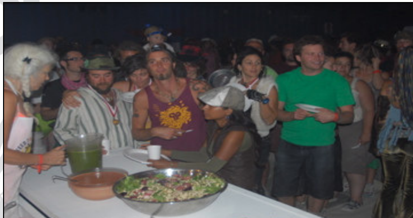
Serving guests on (Saturday FtA dinner)