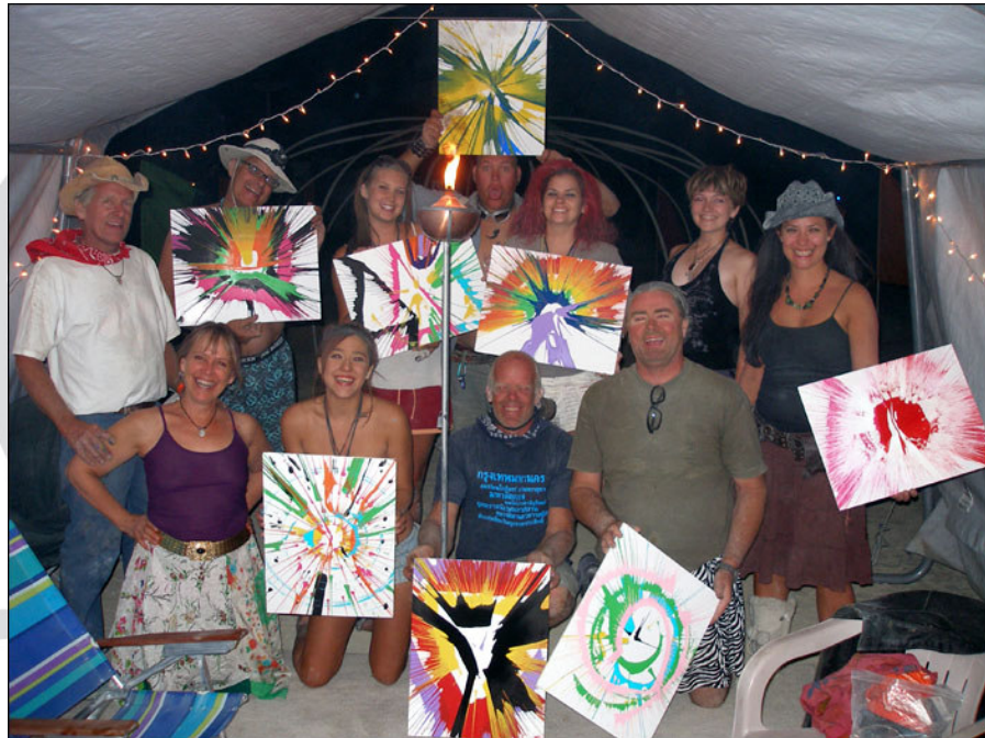
Luminous Passage Crew at Spin Art Camp FtA Dinner

We led the way and demonstrated, by example, that with the simple, archetypical gift of a nourishing, heartfelt meal, community support for BM's artists can evolve and become more direct and participatory, a sense of community can be developed between previously disparate groups that promotes collaboration and the sharing of resources, and a largely forgotten expression of appreciation and gratitude can be re-introduced to the BM community and then be the default world.